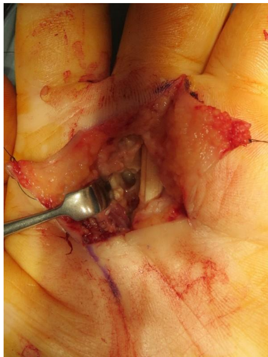
Figure 3. Intraoperative finding of case 1: There was a fistula in the metacarpal neck