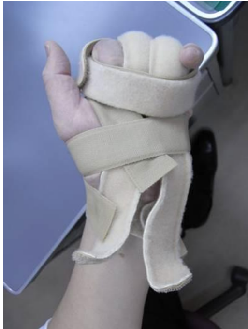
Figure 4. Hand based splint: It started than weak power of traction and gradually lengthened wearing time in case 1 and 2