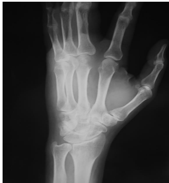
Figure 2. (a) Antero-posterior view of the left hand on initial visit