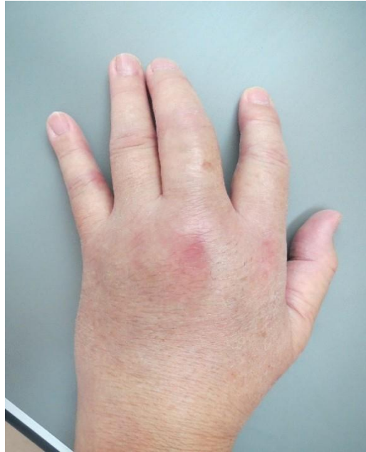
Figure 1. Initial presentation of case 1: The middle of the left volar hand was enlarged to the dorsal side, and it was impossible to flex a middle finger

A 64-year old male was treated with swelling of fingers and excursion restrictions in the right in other hospitals. Because swelling was not improved, he consulted our hospital. The right middle finger was swelling and extended to the dorsal side. There was inflammation along a tendon sheath in the right by the surgery and it was eliminated and washed site of inflammation (Figure 5). Excursion restrictions and the swelling are improved, and ADL (activity of daily living) does not have any problem.