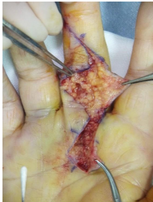
Figure 5. Intraoperative finding of case 2: There was inflammation along a tendon sheath and washed site of inflammation